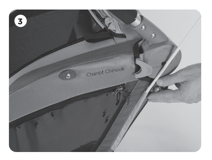
A. Insert the flagpole into the sleeve on the left hand side of the body. (See image 3)