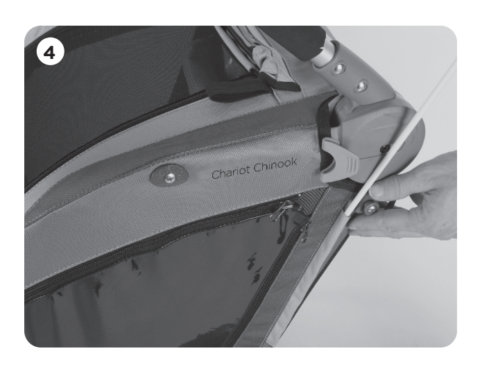
A. Insert the flagpole into the sleeve on the left hand side of the body. (See image 4)